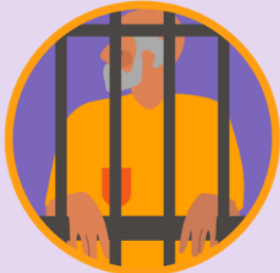
People with prison experience