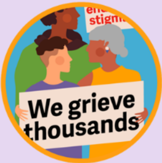
People who use drugs