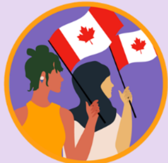
Immigrants and newcomers