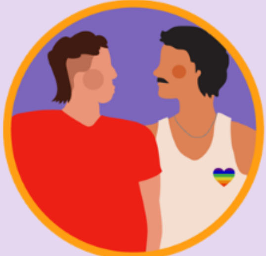
Gay, bisexual and other men who have sex with men